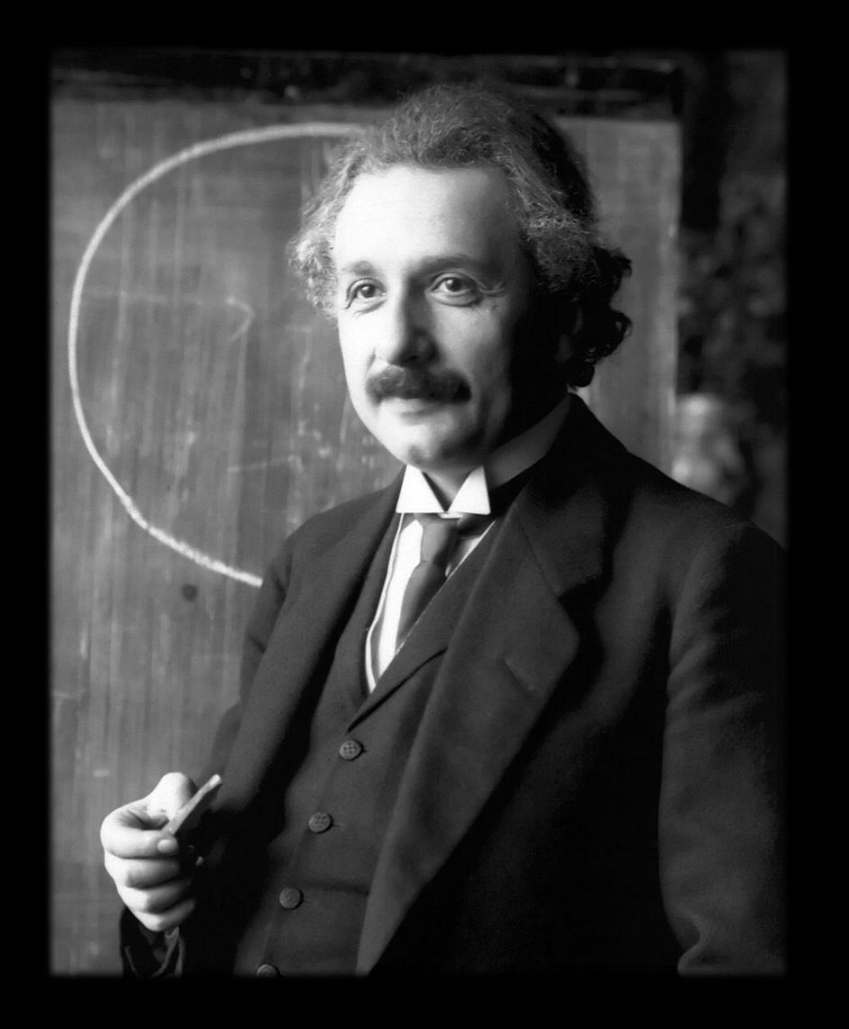
"I have no special talents, I am only passionately curious"